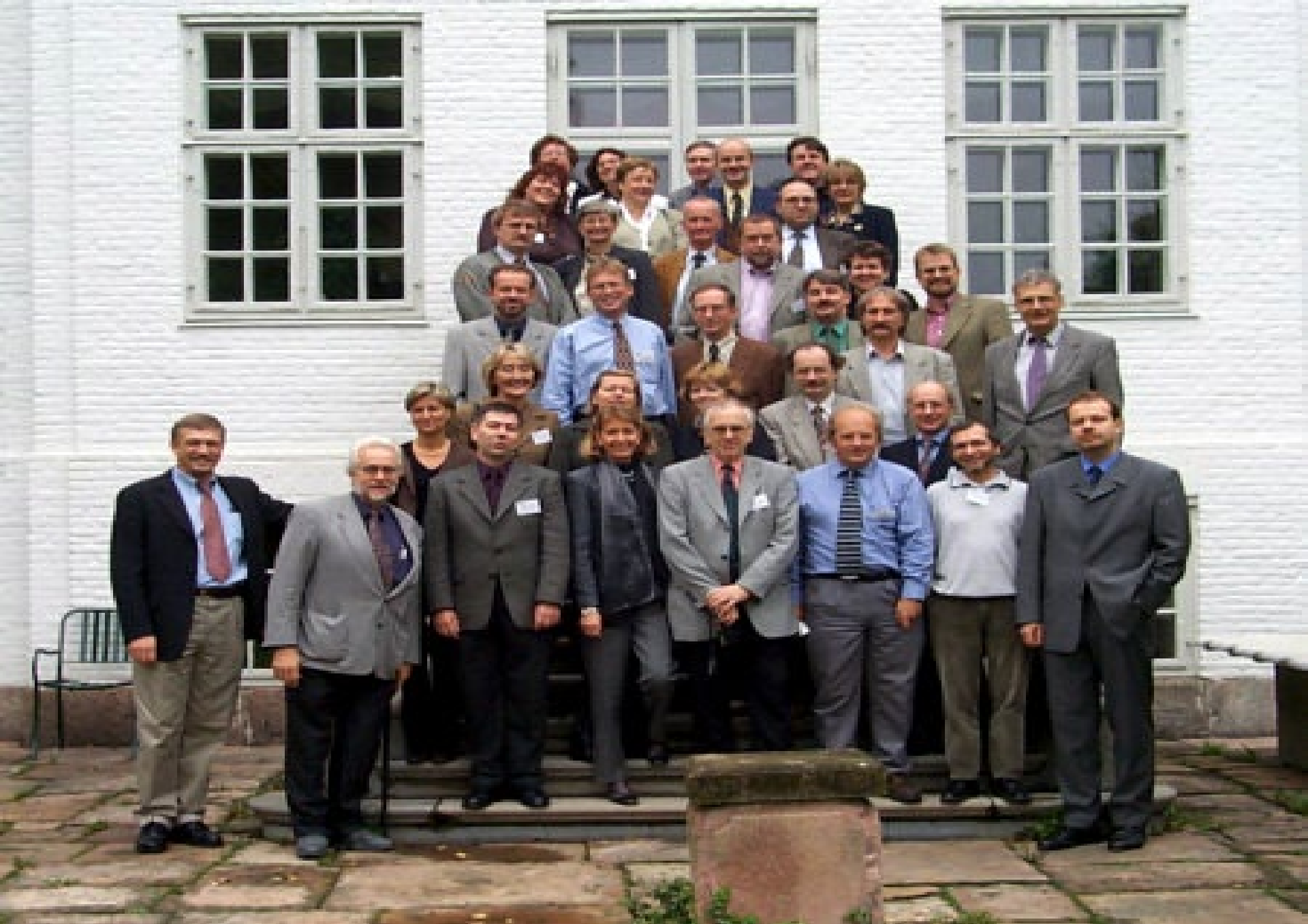
PDR meeting Copenhagen 1999 Held May 2nd-3rd 1999